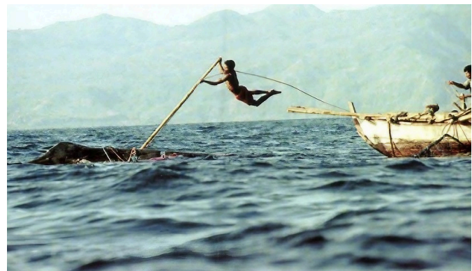
Figure C.5: A Lamalera whale-spearer jumps from a boat, spearing a whale in Lembata Island, East Nusa Tenggara Province. Credit: Lamafa (spearer) jumping from peledang boat to a whale by Bambang Budi Utomo is in the public domain in Indonesia.

This makes sense in the case of sharing hunted meat as well. In environments without refrigeration technology or in highly mobile groups where food storage is not feasible, the killing of a large animal will result in leftover meat. Sharing that meat with hungry community members has a lot of value to those receiving the meat. Then, at some point in the future, the person who received the meat may successfully hunt and share with others. Figure C.5 displays an Indigenous hunting party from Malaysia. Food is widely shared in small-scale societies, particularly when the item is large in size and when there is a lot of uncertainty around when the next successful hunt will occur (Gurven 2004). But, as with other skilled activities, some individuals are better hunters than others and acquire more meat than others consistently, so why would highly skilled hunters give more food to low-skilled hunters than will be reciprocated (e.g., Gurven et al. 2000)? Again, reciprocal altruism is one piece of the story but cannot explain all sharing behavior.