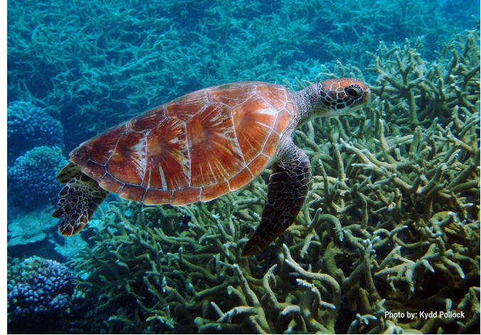
Figure C.6: Green turtle.

Among the Melanesian Meriam Islanders, turtles (Figure C.6) are hunted at two times of year; during the turtles' feeding/mating season, which is risky and unpredictable, and during the turtles' nesting season, which is low risk and relatively easier. Turtles hunted during the feeding/mating season are typically shared widely in the community, while turtles hunted during the nesting season are consumed by a small number of households. This suggests that more people know about high-risk hunts, which may result in hunters gaining more prestige for their successful hunts. Evidence also shows that hunters involved in high-risk hunting gain social and reproductive benefits, such as having children earlier and having more sexual (or reproductive) partners (Smith, Bliege Bird, and Bird 2003). While some sharing behavior may be best explained by a desire to display one's skills to gain reputational benefits, it cannot explain all sharing behavior and likely works in conjunction with the other hypotheses described above.