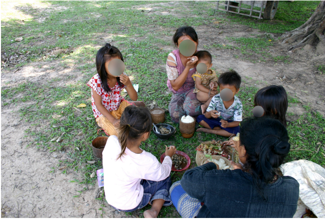
Figure C.4: Lao family eating together.