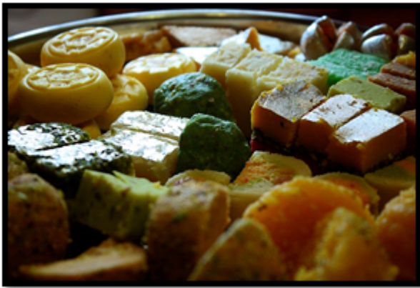
Figure C.2: Sample of sweets to celebrate Diwali, a Hindu festival of lights.

Human behavioral ecology uses the theory of evolution by natural selection to understand how modern behaviors were advantageous in our evolutionary history . For most of human history, humans lived as hunter-gatherers, meaning they collected or hunted food; they typically resided in small communities with individuals related through blood or marriage; and they had no access to modern medicines or other modern conveniences. It is useful to think about this environment—which is much different than how humans live today—to help us understand how current behaviors may have evolved. For example, humans today enjoy consuming food high in fats and sugars (Figure C.2; see Chapter 16). In the past, eating fatty and sugary food was a good survival strategy since food was limited in this environment and these foods contained a lot of calories. Over time, those individuals who sought out these foods were probably better able to survive and reproduce, resulting in a population of people today who have preferences for these foods. In modern environments, where food is abundant, this preference has