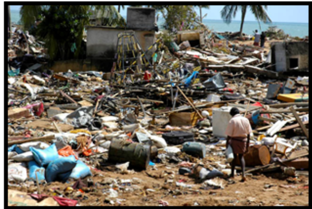
Figure C.1: Aftermath of the 2004 Asian Tsunami in Sri Lanka.

On December 26, 2004, an earthquake in the Indian Ocean resulted in a tsunami that killed over 200,000 people in at least a dozen different countries (Figure C.1; Editors of Encyclopedia Britannica 2018). In the aftermath, 30% of households in the United States donated an estimated $2.78 billion to help the victims (Center on Philanthropy at Indiana University 2008). At the same time, despite being one of the wealthiest countries in the world, the United States has over a million children who experience homelessness each year (National Center for Homeless Education 2017). Why is it that sometimes humans work together to help those in need, but at other times, humans struggle to solve basic problems? The field of Human Behavioral Ecology seeks to understand this and many other questions to learn why humans behave the way they do. Human Behavioral Ecology is the field of anthropology that explores how evolutionary history and ecological factors combine to influence human behavior.